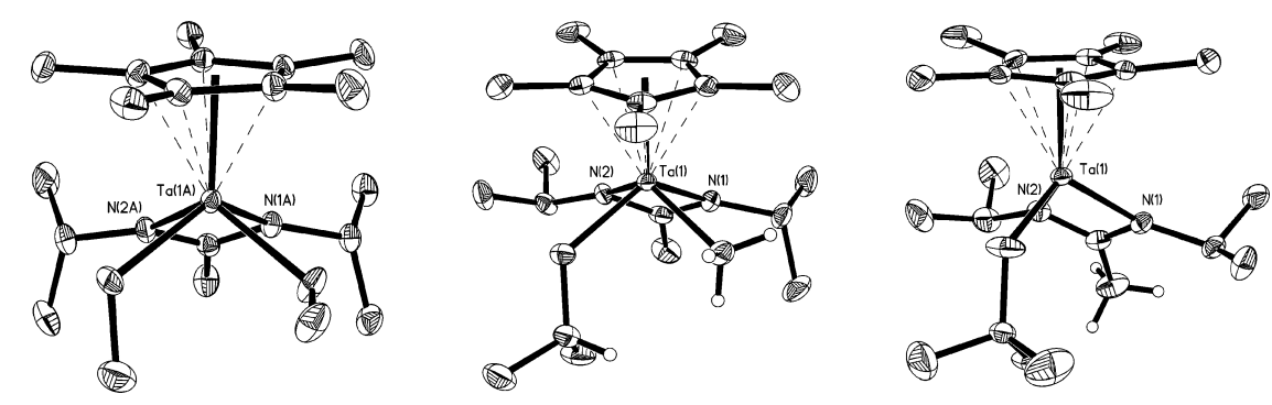
Figure 1. Molecular structures (30% thermal ellipsoids), from left to right, of compounds 7, 10, and 12. The [B(C_6F_5)_4] anion of 12 and all hydrogen atoms, except for selected ones in 10 and 12 that are represented as small spheres of arbitrary size, have been removed for the sake of clarity.